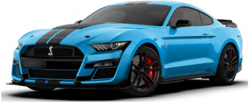
2020 Shelby GT500 5.2L GT500CB....

Thanks for purchasing a Stainless Works catback exhaust system for your 2020+ Shelby GT500 5.2L. Our team has worked to ensure that this product is premium in performance, quality, and fitment. We are proud to say that this system will unleash the true character of your vehicle. We encourage you to read through the following steps, and check the included Bill of Materials before beginning. Please follow these steps to ensure that your installation goes as planned.