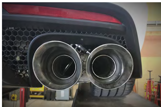
Detail 12b: Tip alignment/clearance in OEM valence