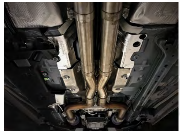
Detail 9: X-pipe and mid pipes installed (factory connect shown)