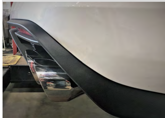
Detail 15: View from side/rear of vehicle