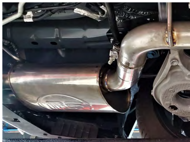
Detail 12a: Left muffler assembly installed

If equipped, we recommend disconnecting the exhaust valve motors before performing any welding.